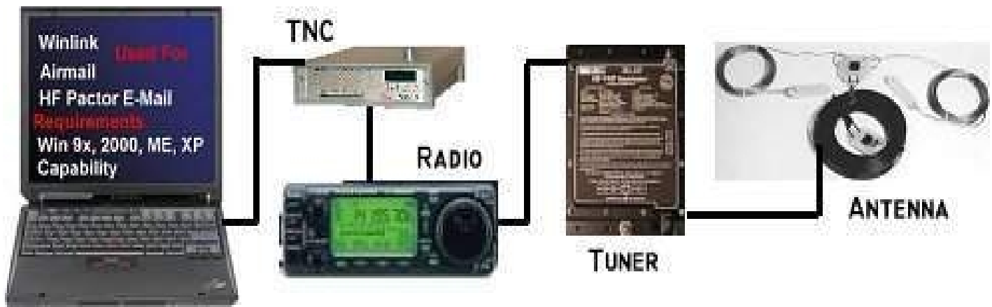
Figure 1 - Basic Equipment for HF Data/E-Mail including laptop, TNC Modem, Radio, Antenna Tuner and Antenna

Since the advent of satellite communications, the need for phone patches with conversations to loved ones that would sound like “I love you honey, OVER” gradually gave way to telephone like we know them today. This also gave way to the DND funding that was in place and the gradual disappearance of CFARS in our collective vocabularies. But since there was a CF component in the CFARS, there have been temptations to formerly retire it on at least a couple of occasions. This would have happened only for the intervention of dedicated members both in and out of uniform who kept the heart beating through innovation and active engagement with government and emergency services such as Industry Canada, Public Safety Canada, Amateur Radio Emergency Services (ARES), the RCMP, Transport Canada, Civil Air Search and Rescue Association (CASARA) to name a few. Innovation in areas such as provision of internet accessibility over HF, with the ability to send and receive data such as e-mail, video, electronic images, etc., is now a reality. Phone patches are still possible, but are not a large part of what CFARS members do on a day-to-day basis. CFARS affiliate operators now own and manage five HF gateways providing access to the internet that allows anyone with a laptop computer, a radio and a modem (see figure 1) to access their e-mail via HF gateways.