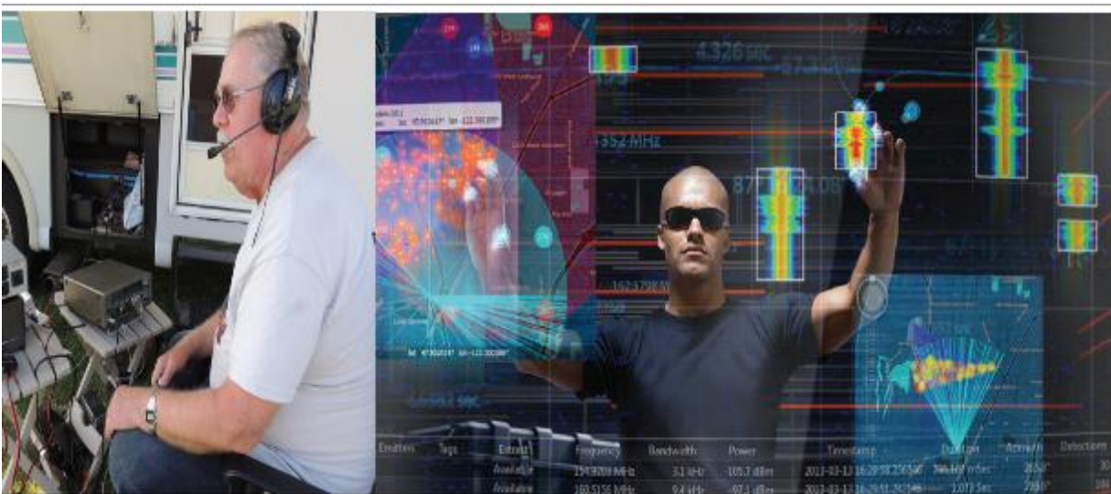
Figure 1-1: Conventional vs SDR: A regular radio operator is shown on the left, an operator with Software Defined Radio on the right.

SDR is too vast of a field to cover in this column, but it offers an amazing advancement over our older desktop rigs that can only monitor one frequency (maybe two) at a time. For example, vast parts of the spectrum can be monitored at the same time, and recorded for later playback and analysis. If you are interested in listening to utility transmissions from marine, air, military and others, SDR lets you find those transmissions very easily by visual scanning of the spectrum. These types of short transmissions on nearly random frequencies would ordinarily elude a listener trying to find them by spinning a dial. Lots more can be written about the advantages (and some disadvantages) of SDR, but see Figure 1-1 for an illustration of the difference.