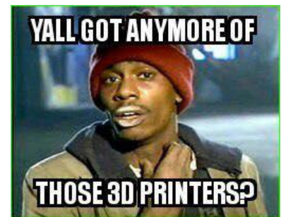
Figure 1-1: 3D printers can be addicting

With each passing week, more hams and tinkerers are realizing the usefulness of 3D printers, and more people every week I've spoken to have bought one or are about to. The printers are quickly becoming standard tools, sitting alongside multimeters and hand drills and soldering irons. Some people buy them as a means to an end to create some project, some because of their general usefulness, and others because we finally have a machine that can take anything the imagination fancies and convert it into a real-life object. For others, the printers can be somewhat addictive as they outgrow one and acquire another with more capabilities and features (see Figure 1-1).